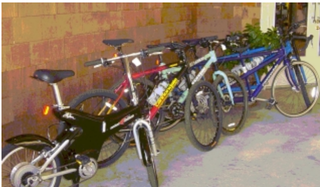
A few of the bicycles that will be offered as prizes

For information and to register for the Folsom activities go to http://www.50corridor.com/ ☼