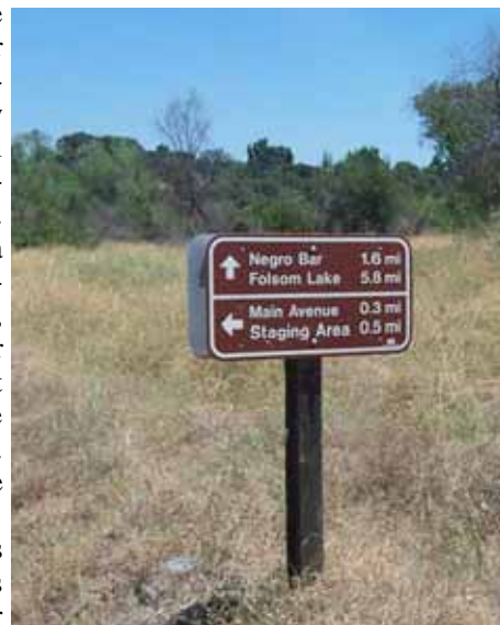
A rare sign on the American River bike trail the trail pedestrians

You can see SABA's letter on the subject at: http://www.sacbike.org/letters/ ☸