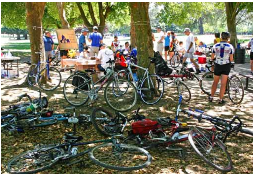
Many bikes and bikers at SABA's summer picnic. Story page 4.