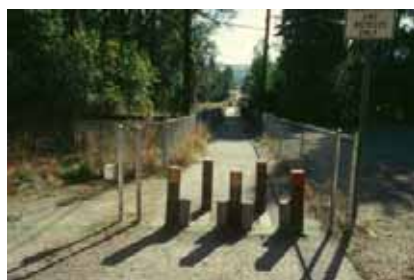
Two other examples of bollard design. Photos from Pedestrian and Bicycle Information Center