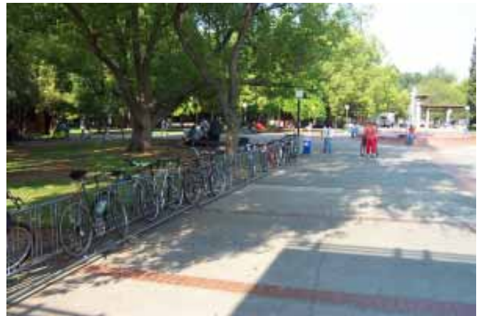
Sacramento City College quad showing healthy bicycle usage.

The draft report is posted on SABA's Web site, www.sacbike.org . If you know of additional problem areas at or around any of these campuses or have ideas on how they can become more bike-friendly, please let us know by dropping a line to saba@sacbike.org . The report will be put into final form in late November and presented to the Los Rios Community College Board at its Dec. 12 meeting. ☸