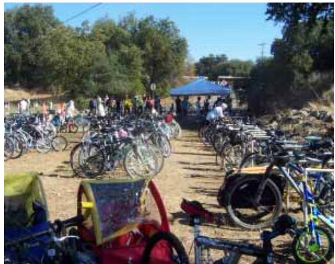
Salmon festival parking compound.