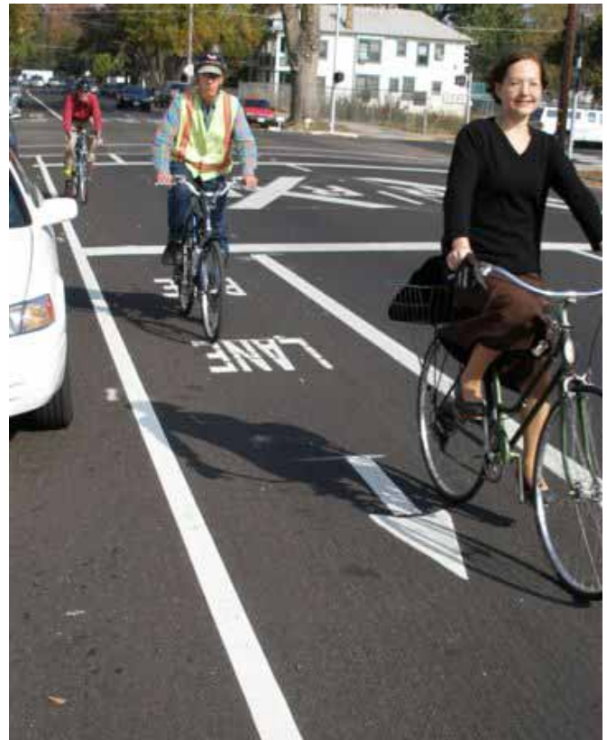
Participants try out new lanes on 19 th Street to reach the celebration.

The transformation of 19 th and 21 st streets has been a priority for SABA for many years. Thanks to perseverance by advocates and leadership by the City Council, Sacramentans have two more complete streets. Next target: downtown. ☸