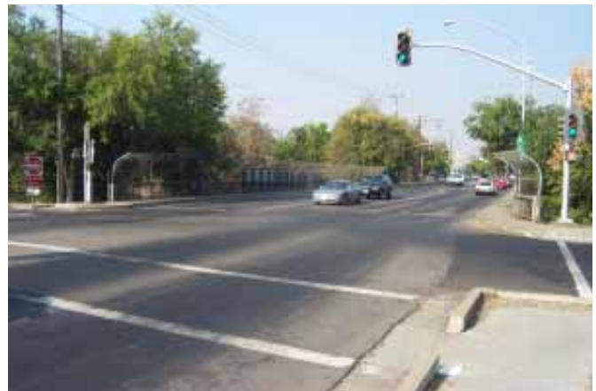
Sutterville Road and 12th Avenue crossing showing space available for bicycle lanes through restriping.