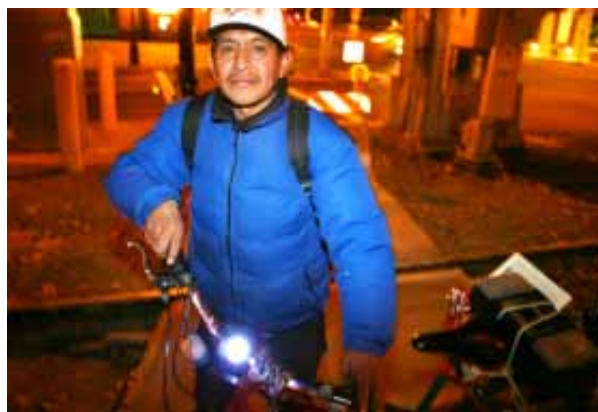
A Light On! recipient at the Tower Bridge.

evenings. Passing cyclists were hailed and the volunteers installed the lights on the spot. In exchange for receiving the lights, SABA asked recipients to pledge to read a